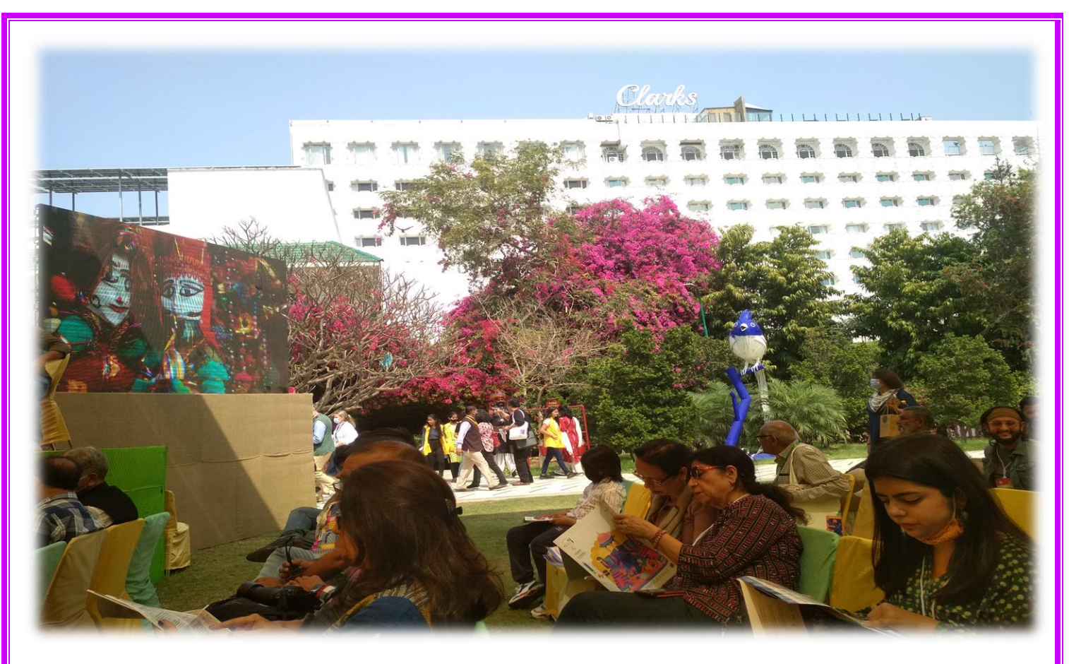
The Festival Bazar Scenes (Below)