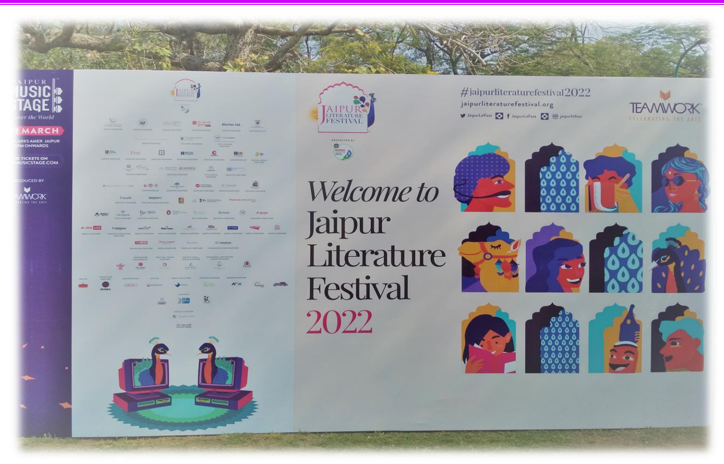
Monitors Across the Clark Hotel Grounds to Display Writers Talk About Their Books (Below)